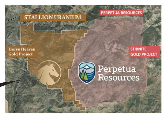
Horse Heaven, Idaho